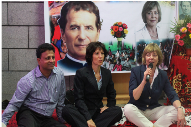
The First Lady of the Federal Republic of Germany, Ms Daniela Schadt, visited BREADS Project at Bangalore on 8 February