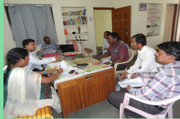
The BREADS Team with the staff of DB PYaR Gulbarga during the Projects Monitoring Visit